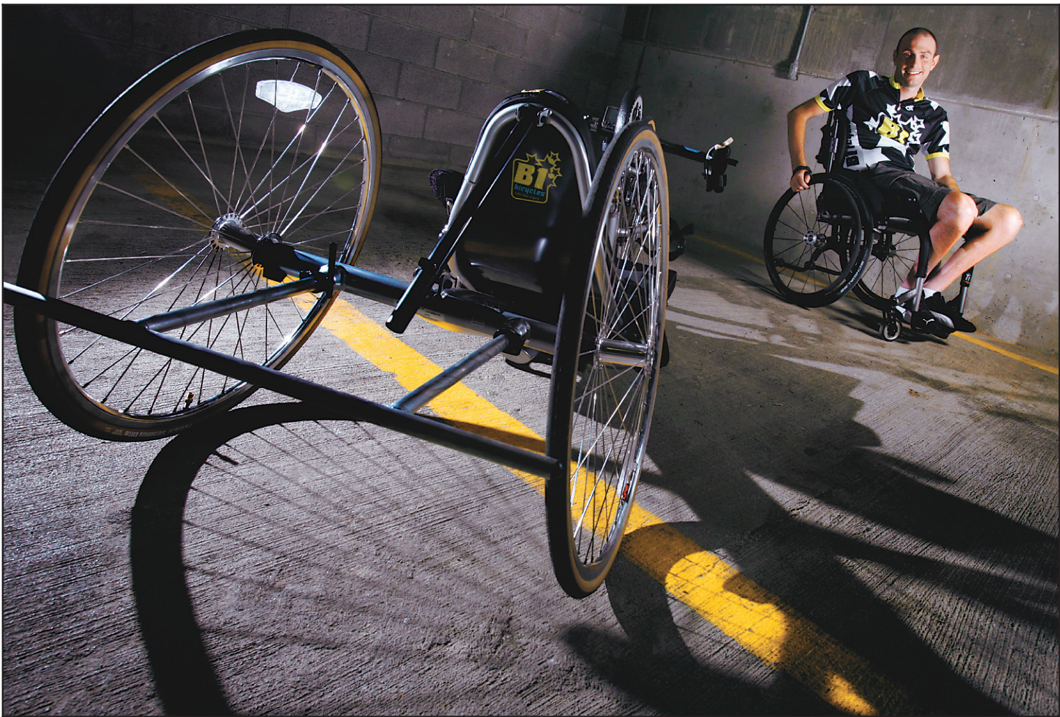
Brent Simonds with the new hand-cranking bicycle he'll use to cover the 102-mile Pelotonia route

Online REVIEW: 'EAT PRAY LOVE' Dispatch.com/multimedia